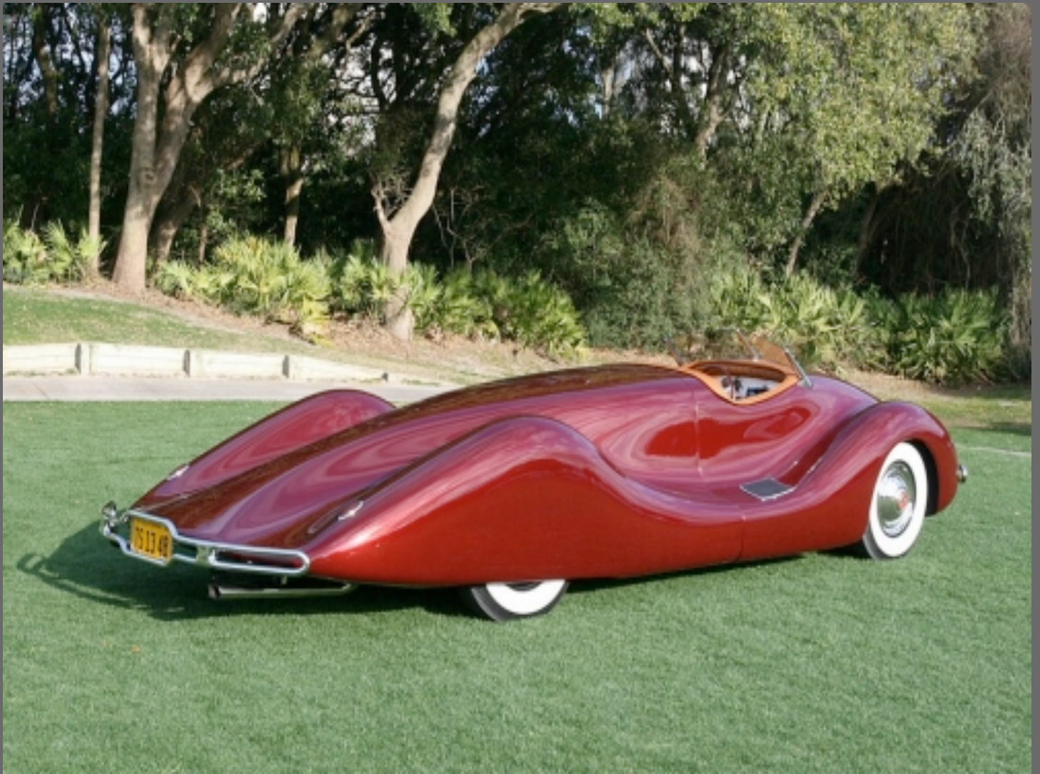
“Cover Girl” restoration